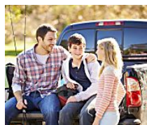
2016 Trucks Of The Year Yahoo Search