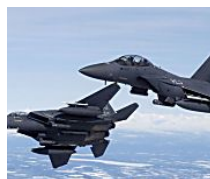
The absolute fastest U.S. Air Force planes in the sky CNET