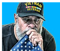
How much money are people getting from reverse mortgages?