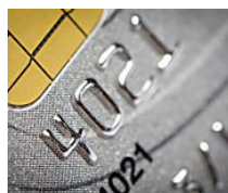
Jaw-Dropping Cash Back Cards You Don't Want To Miss CreditCards.com