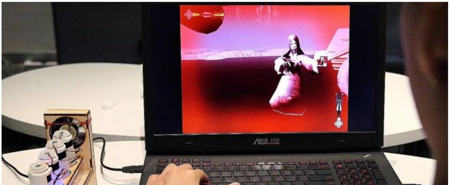
HORROR STORY: Tainted is a 3-D first-person horror adventure game that uses smell-emitting modules and LED lights to enhance the gaming experience.

RC Planes, Cars, Drones & More Free & Fast Shipping. Buy Now! Go to hobbyking.com/US