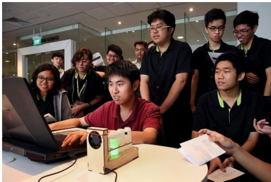
Current students from the Institute of Technical Education (ITE)'s Higher Nitec in Games Art and Design test out Tainted, a horror adventure game designed by former students from Higher Nitec in Games Design and Development last year.

Tainted will be featured this week at the Indie Game Area of the Tokyo Game Show (TGS), which attracts more than 200,000