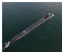
If terrorists ever go swimming, they are so, so dead. CNET