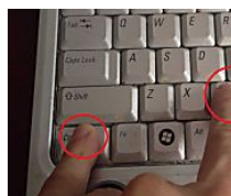
Do This Every Time You Use Your Computer... www.weblifeadvice.com