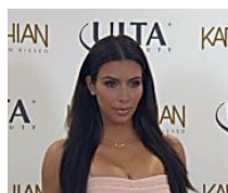
Kim Kardashian West's Jewelry Allegedly Recovered in Paris E! Online