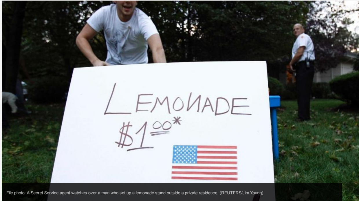
File photo: A Secret Service agent watches over a man who set up a lemonade stand outside a private residence.

What could be better than having a cool glass of lemonade on a hot day? How about having a cool glass of lemonade on a hot day -- that's served over the internet?